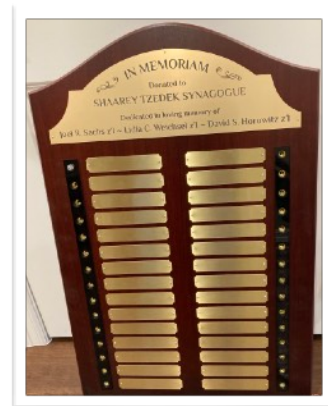
L: Sol Sachs with our portable Aron Kodesh , Ner Tamid and Bimah . R: Yartzeit Board.