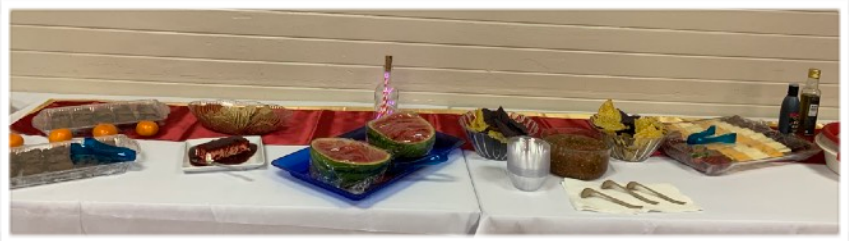
Red (blood) Oneg Theme.