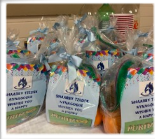
Mishloach Manot Bags, fulfilling the Mitzvah of gift giving for Purim .