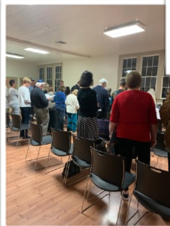
Triangular Oneg Theme.